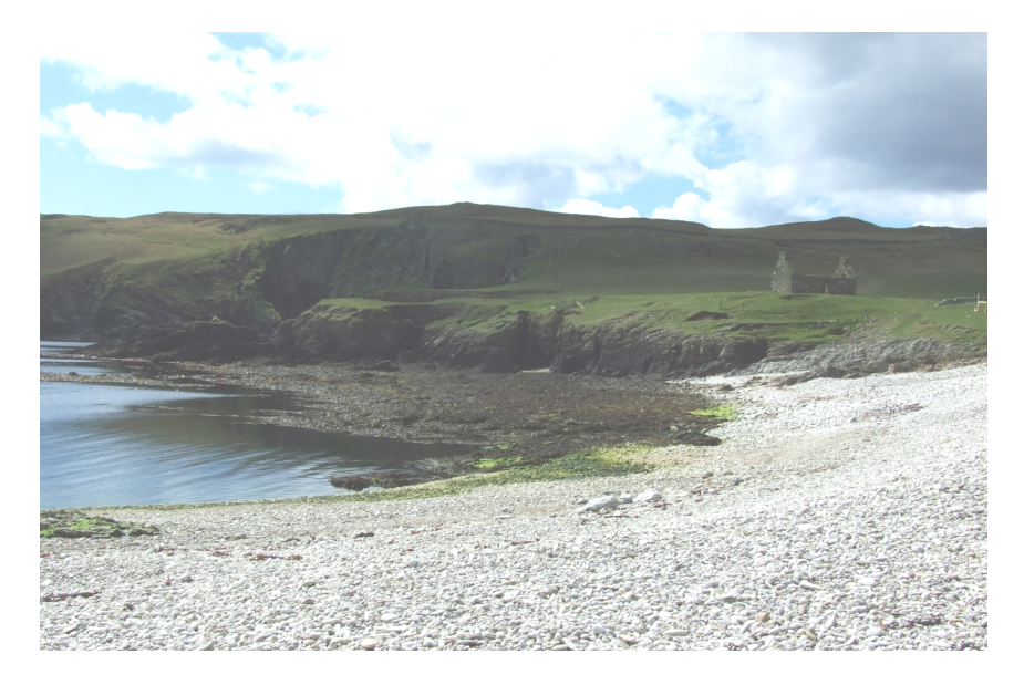
Figure 4 – The Bay of Funzie with ruined crofthouse on the hill (2007)

Brimacombe's efforts can be viewed in light of Vera Rebollo's contextually different suggestion that "goals of integrated coastal area management should be reconciled with those aimed at the recovery of historical and cultural heritage" (Rebollo, 2001: 66). But whereas Rebollo is interested in reclaiming insular Mediterranean coastlines from over-development of tourism facilities, Brimacombe is concerned with reclaiming Fetlar's heritage from underdevelopment caused by the pervasiveness of low-intensity crofting: both over-development and underdevelopment inhibit heritage preservation efforts.